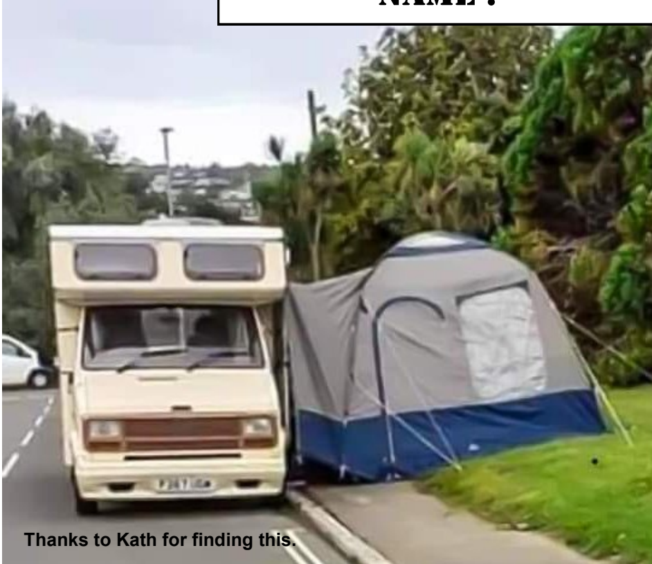
Thanks to Kath for finding this.

Good news from Calor Gas. They will continue with 3.9kg and 4.5kg butane cylinders. Supply will increase following modernisation of their facilities. The cylinders will be exchanged on a like for like basis as more come into circulation.