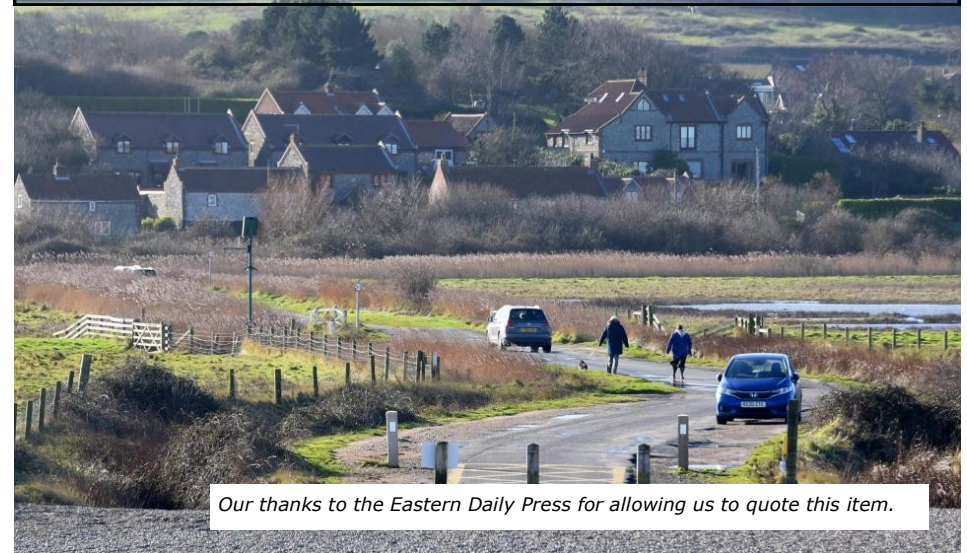
Our thanks to the Eastern Daily Press for allowing us to quote this item.

Villagers say a ban on motorhomes at a popular beauty spot being imposed because of unhygienic behaviour does not go far enough... as it doesn't cover caravans.