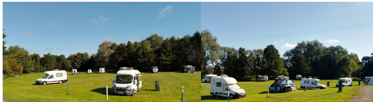
A selection of Romahomes of every type. Plenty of space to stretch out.