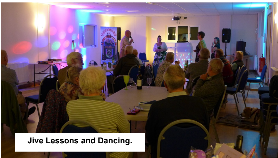
Jive Lessons and Dancing.

We were entertained by 'Jive Lessons and Dancing' which was enjoyable, although only a few brave souls took part in the dancing. The