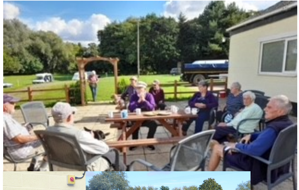
Above. Socialising. We had some great chats and exchanges of ideas.