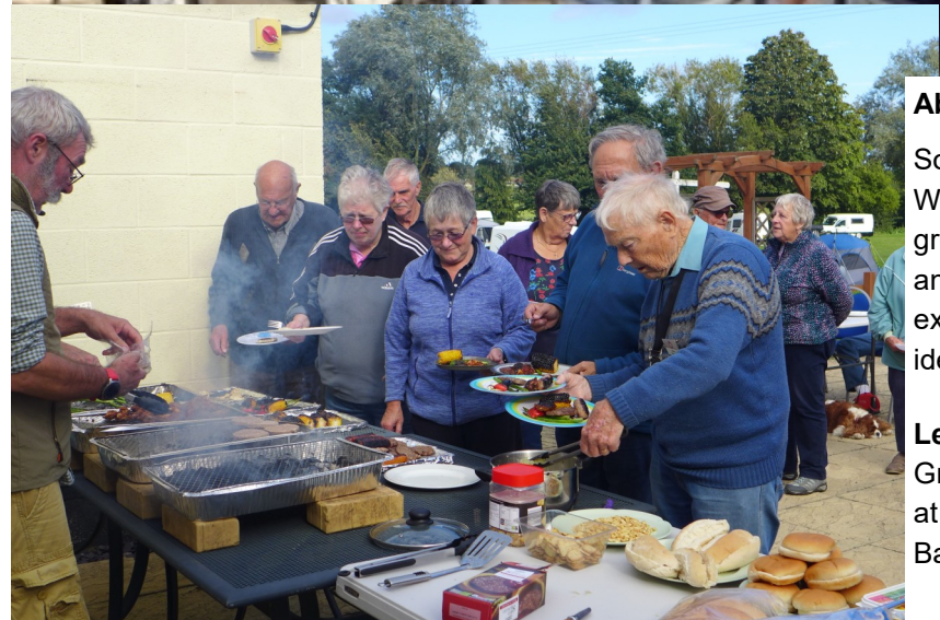
Left. Grabbing food at Sheldon's Barbecue.