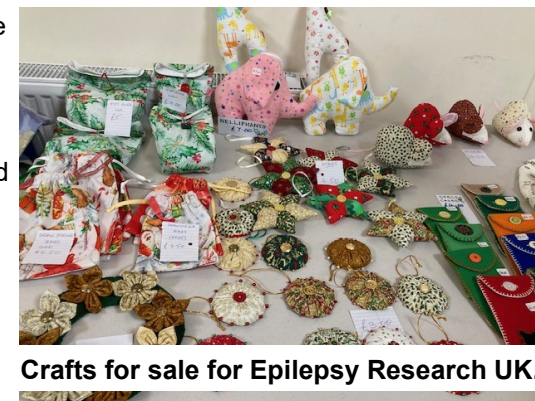
Crafts for sale for Epilepsy Research UK.