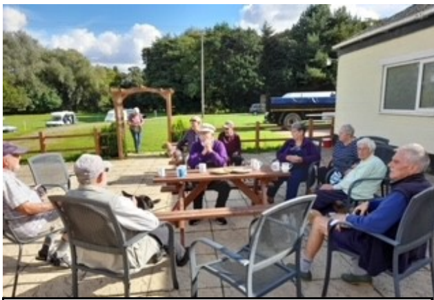
Socialising in the sunshine.

Friday saw Romahomes making their entrance and club members being made welcome with tea and biscuits or coffee and biscuits. It was a nice sunny day, so a great deal of socialising took place on the seats outside the clubhouse/hall building.