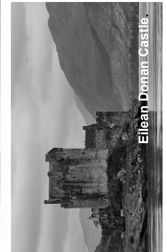
Eilean Donan Castle.