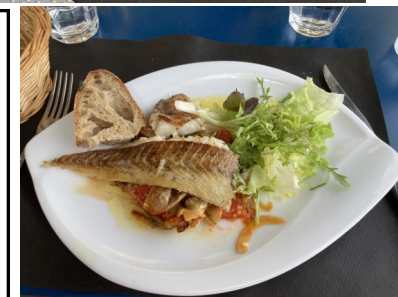
We spent time in the Loire area visiting many places of interest and restaurants. We enjoyed lots of Wonderful Food. (too much according to the scales.)