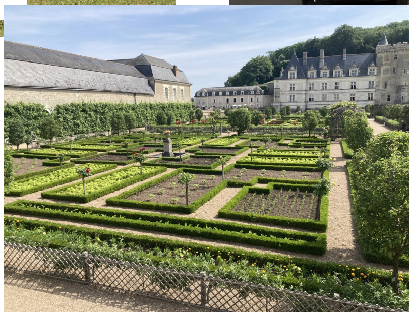
<<< On to happier thoughts. I celebrated my birthday while we were away and Freddy took me to the Chateau De Villandry. It was amazingly beautiful with very extensive gardens and water features. It was a very hot and sunny day. A very happy birthday.