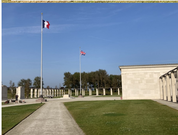
All the names of the men who died are listed on the columns. My dad was involved in the D-Day landings and happily his name is not listed