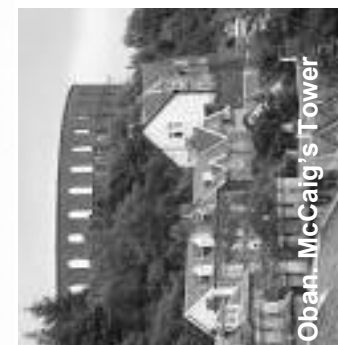
Oban McCaig's Tower