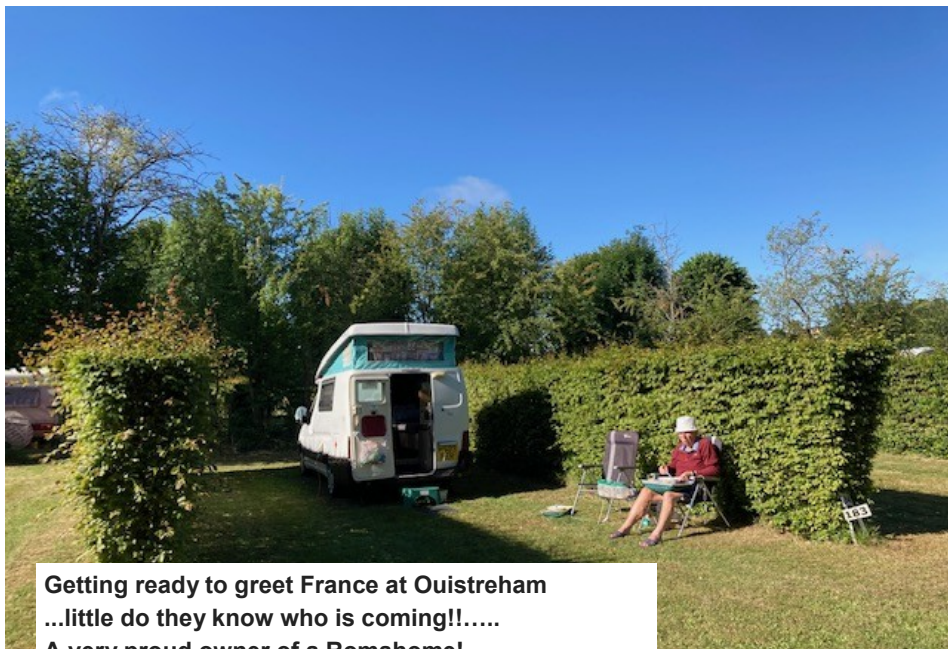
Getting ready to greet France at Ouistreham ...little do they know who is coming!!..... A very proud owner of a Romahome!