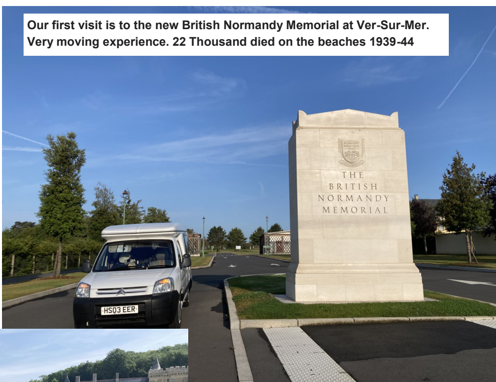
Our first visit is to the new British Normandy Memorial at Ver-Sur-Mer. Very moving experience. 22 Thousand died on the beaches 1939-44