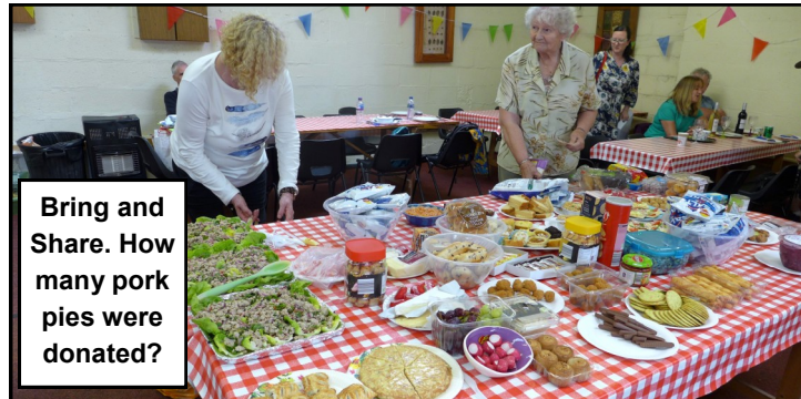
Bring and Share. How many pork pies were donated?

Saturday morning came with lots of sunshine. This was a 'do your own thing' day. Some people went into Chester by taxi or campervan and some did walks round the area into Great Budworth Country Park. Some just stayed and enjoyed the peace and quiet and sunshine on site.